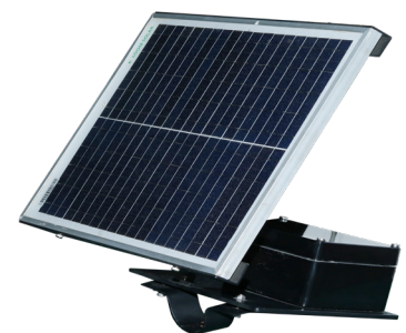
ESP-12V1A SOLAR POWER SUPPLY, 12 VDC, 1 A