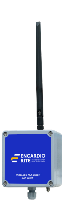
NEXAWAVE TILTSENSE TILT METER