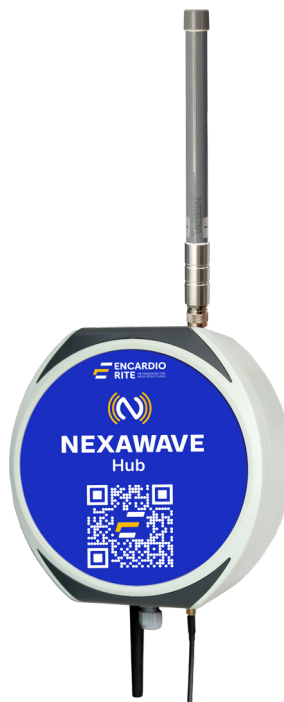
NEXAWAVE HUB GATEWAY