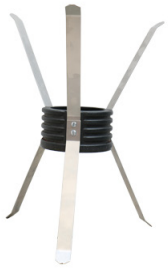
Special spider magnet